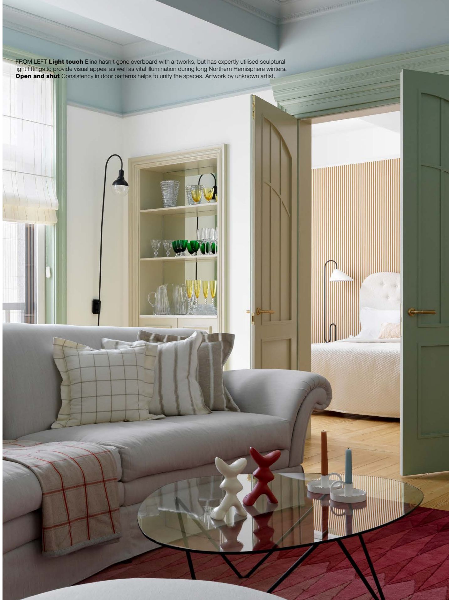
FROM LEFT Light touch Elina hasn't gone overboard with artworks, but has expertly utilised sculptural light fittings to provide visual appeal as well as vital illumination during long Northern Hemisphere winters. Open and shut Consistency in door patterns helps to unify the spaces. Artwork by unknown artist.