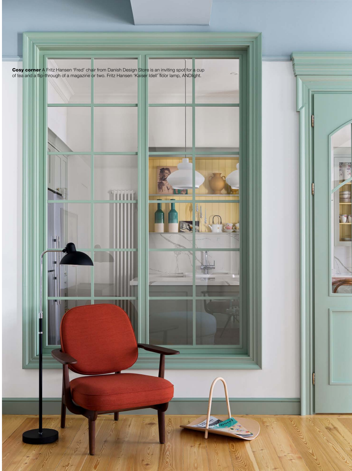
Cosy corner A Fritz Hansen 'Fred' chair from Danish Design Store is an inviting spot for a cup of tea and a flip-through of a magazine or two. Fritz Hansen 'Kaiser Idell' floor lamp, ANDlight.